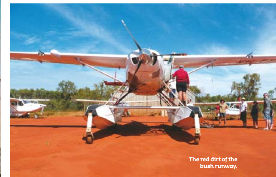
The red dirt of the bush runway.

The rocky terrain here has its full complement of native marsupials because feral animals such as pigs, cats, camels, foxes and →