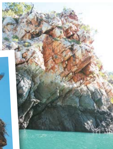
Clockwise from right: Cyclone Creek; the walkway to Gantheume Point; ochre pools formed by the rain; an osprey nest spotted during the self-guided walk.