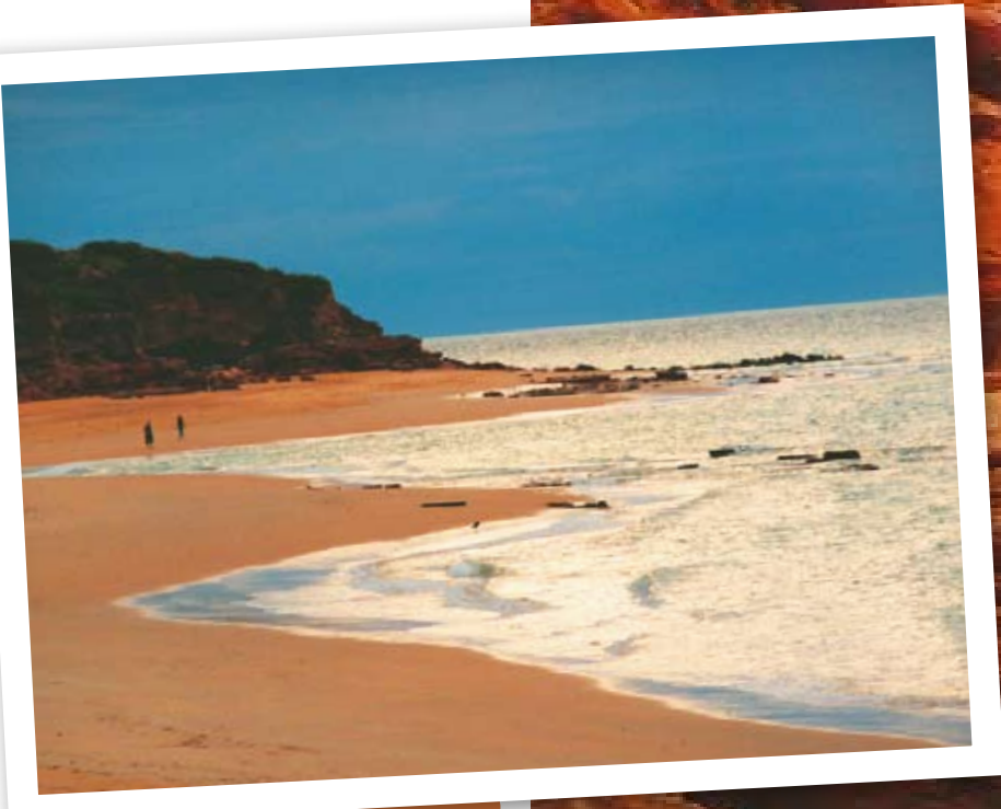
Inset: Silver waves wash up on Eco Beach. Pass by these cliffs during Eco Beach's self-guided walk.