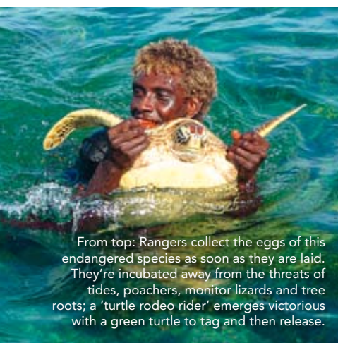
From top: Rangers collect the eggs of this endangered species as soon as they are laid. They're incubated away from the threats of tides, poachers, monitor lizards and tree roots; a 'turtle rodeo rider' emerges victorious with a green turtle to tag and then release.

fishing. In the nesting and hatching season (September to April), TDA rangers tag nesting females, protect and relocate nests and collect data on how many eggs have hatched successfully. Guests can camp rough on Queru Beach and wait to be roused to watch the leatherback hatchlings erupt through the sand and totter towards the water.