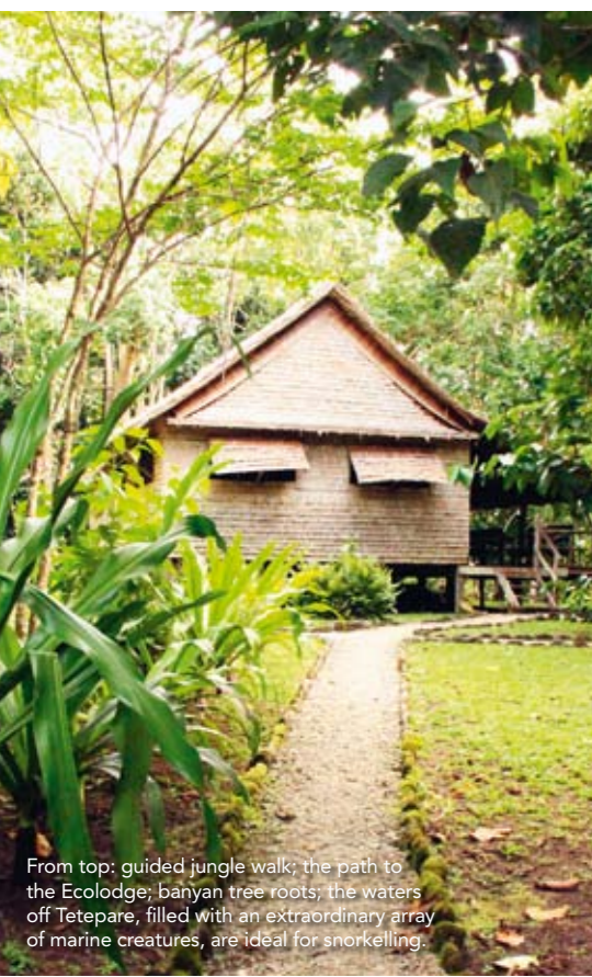
From top: guided jungle walk; the path to the Ecolodge; banyan tree roots; the waters off Tetepare, filled with an extraordinary array of marine creatures, are ideal for snorkelling.